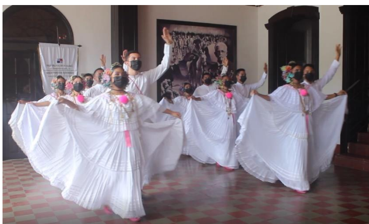
Traditional Dance “Paloma Titibú” Folkloric Dances Academy Francisco De León, Panamá.