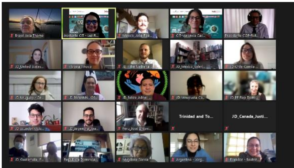
Group Photo 1 – COP10.1 Delegations from: Brazil, Mexico, Costa Rica, The United States, Caribbean Netherlands, Chile, Uruguay, Panama, Belize, Venezuela, Dominican Republic, Ecuador, Argentina, Peru, Guatemala, Trinidad and Tobago and Canada.