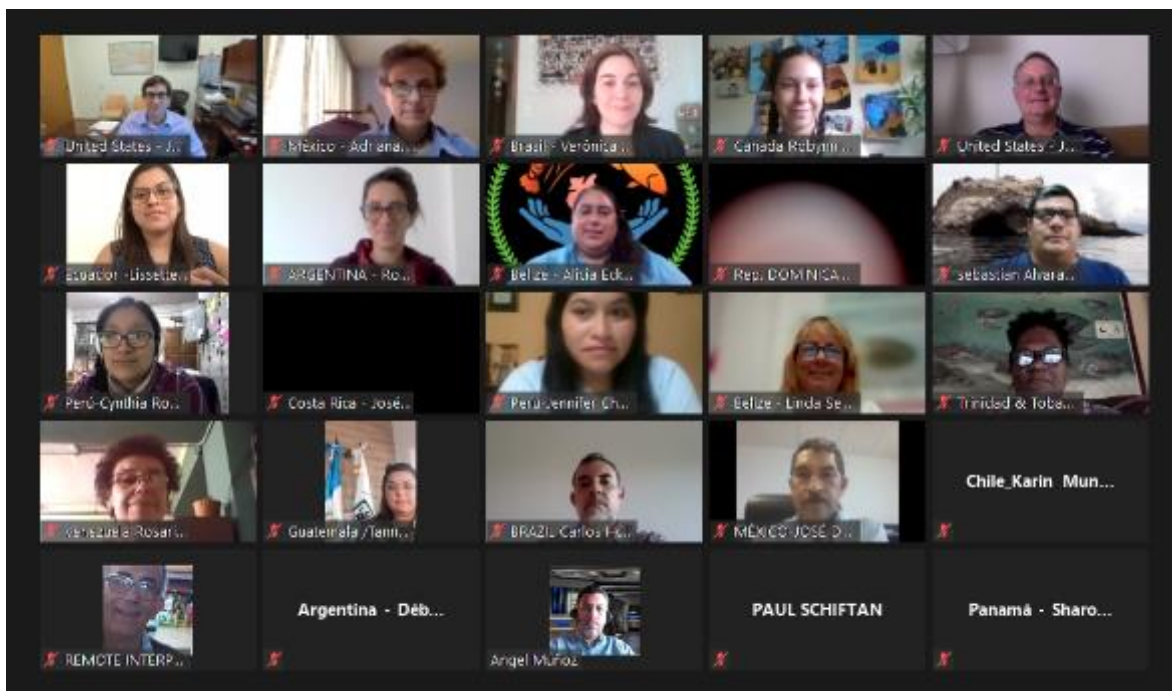
Group Photo – COP10.2